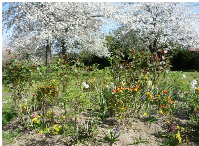
Saeeda's beds and spring blossom

We have a couple of beds which need a volunteer to take charge and plan the planting, with the rest of the group helping with the work. We would be very happy to welcome more volunteers plus any ideas for the improvement of Kendor Gardens.