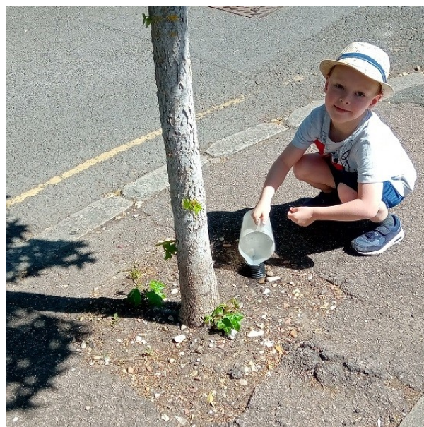
This local resident loves watering the young trees!