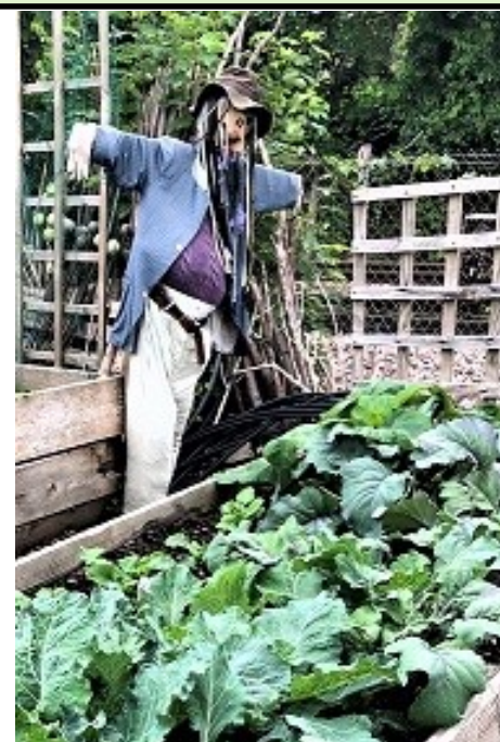
A useful scarecrow among the veg beds