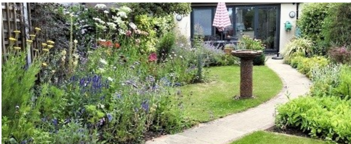
A magnificent variety of flowers surrounding the bird bath focal point

"For me it has been great taking the photos. Continually monitoring the weather, the flowers, finding the best angles - a real time consumer. Just what was required. Thanks for the opportunity".