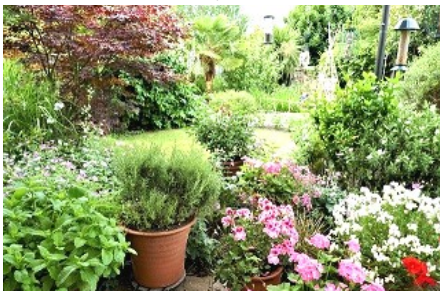
A variety of plants in pots make an eye catching display