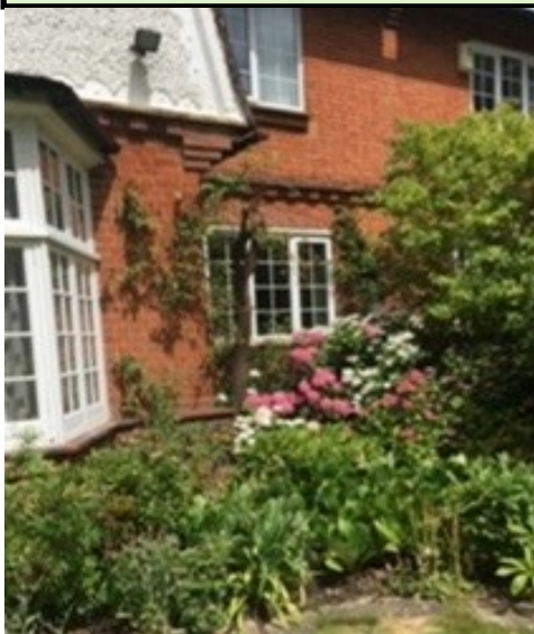
Beautiful hydrangeas bask in the sun