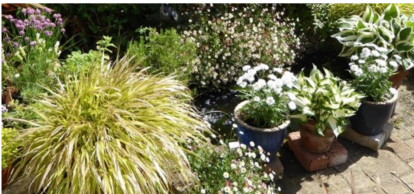
"Amazingly the slugs have left the hostas alone this year - too busy eating everything else."