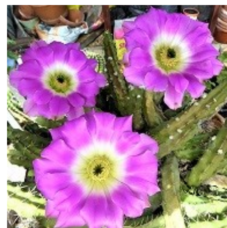
Unusual cacti grown in a green house