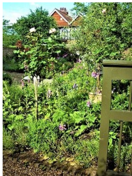
Idyllic front garden in Merton Park