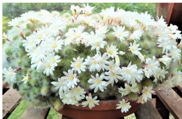
A rare cactus with flowers and no spines!