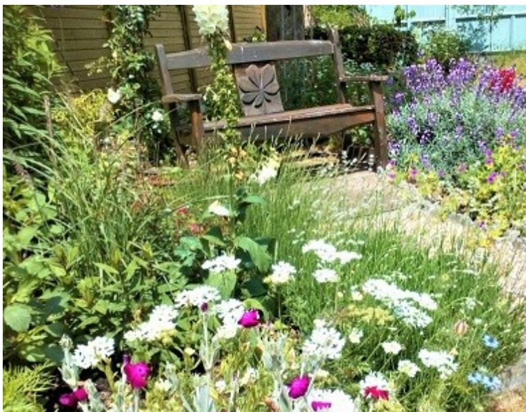
What a comfy bench to relax surrounded by gorgeous flowers!