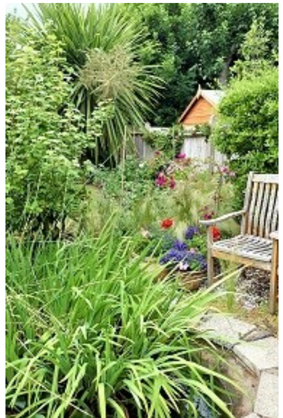
A blissful oasis of calm...