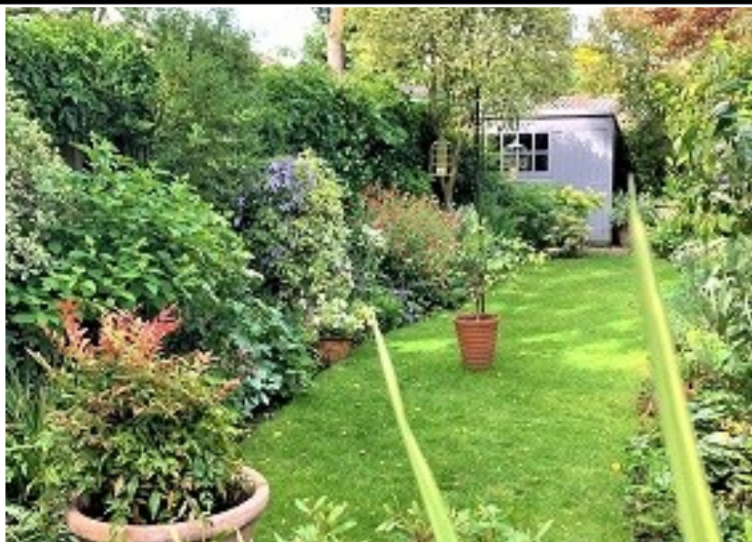
The different plant shapes and textures in these borders create a stunning effect.

The Front Gardens Competition was, sadly, not well supported this time. We do, however, have some photos of very good front gardens so these will form a future display in the Coach House window. If you have any photos for possible inclusion in the display, we would be delighted to receive them.