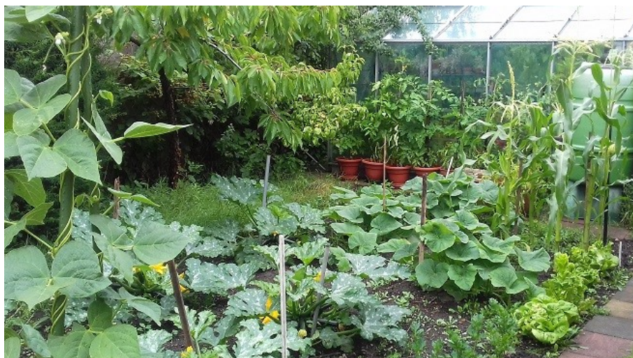
"These at least survived the foxes, the birds got all the cherries!"

The Front Gardens Competition was, sadly, not well supported this time. We do, however, have some photos of very good front gardens so these will form a future display in the Coach House window. If you have any photos for possible inclusion in the display, we would be delighted to receive them.