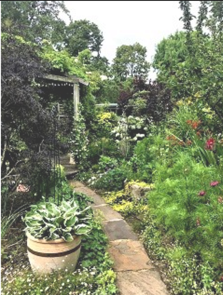
A perfect potted hosta invites you to follow the winding stone path...