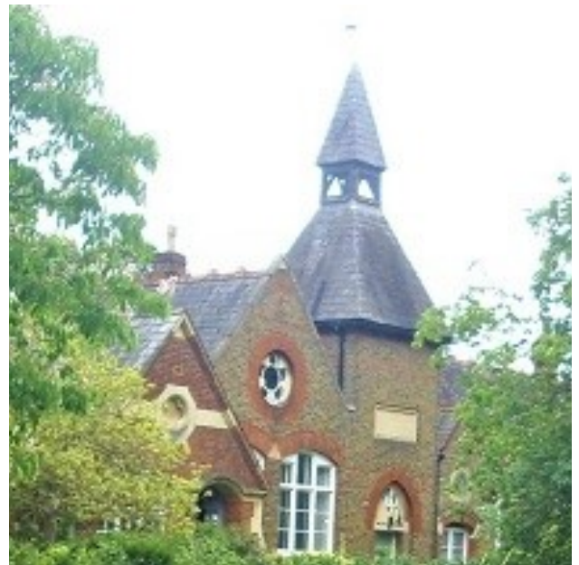
Merton National School, Church Lane

“Merton was quite in the village stage when they were first opened, and one small school sufficed. Now, with the great changes which have come about and the expansion of the little village into an urban