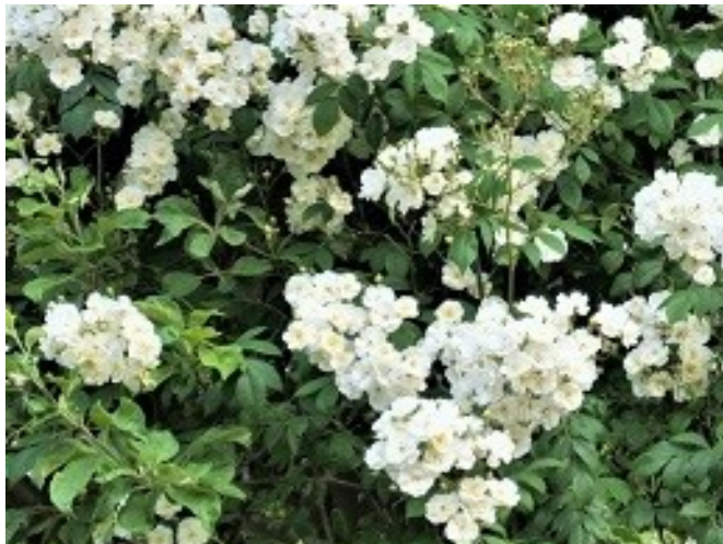
Rambling Rector Rose growing up into a fruit tree rather unusually