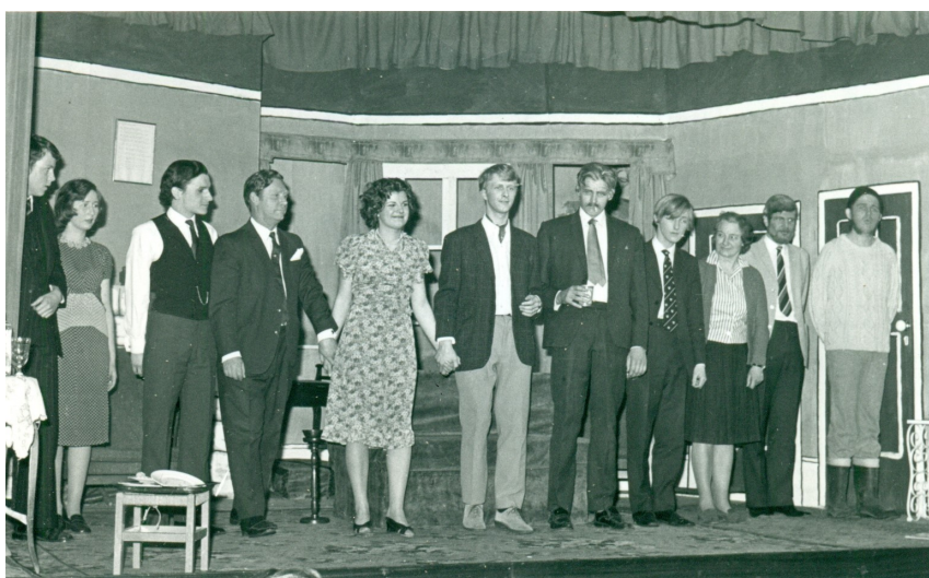
The cast taking a final bow at "And Then There Were None", 1973.